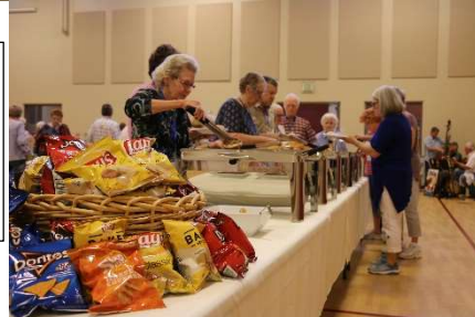
Pictured: Village members enjoying delicious BBQ and sides from Sponsors.