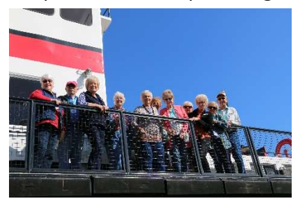
Villagers and guests at the Port of Catoosa

Villagers hit the road and took a day trip to Tulsa to visit the Port of Catoosa, lunch at Roosevelts, and then checked out The Gathering, the featured top tourist destination according to USA Today and most recently, has been named one of the top 12 greatest attractions in the world by National Geographic. A special thanks to Spanish Cove for providing transportation!